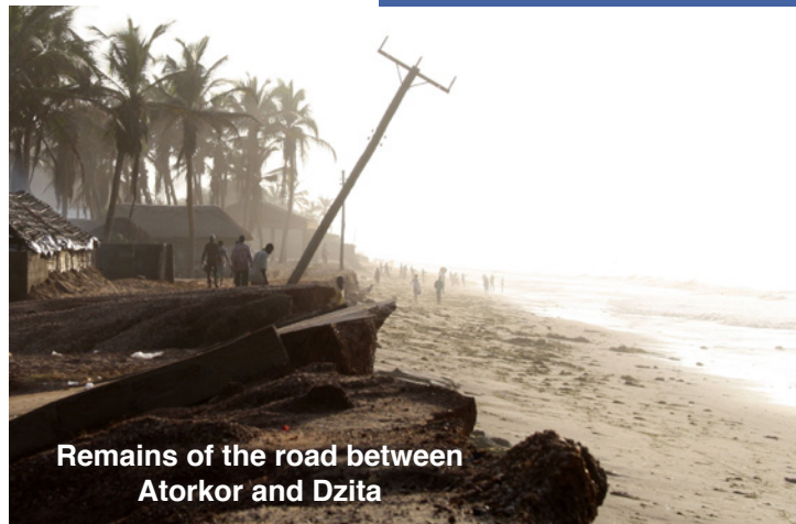
Remains of the road between Atorkor and Dzita