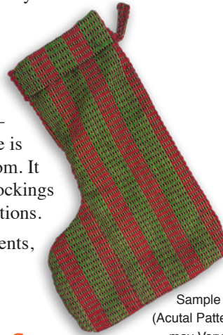
Sample (Actual Patterns may Vary)

To place an order go to www.lumana.org/holiday-2010