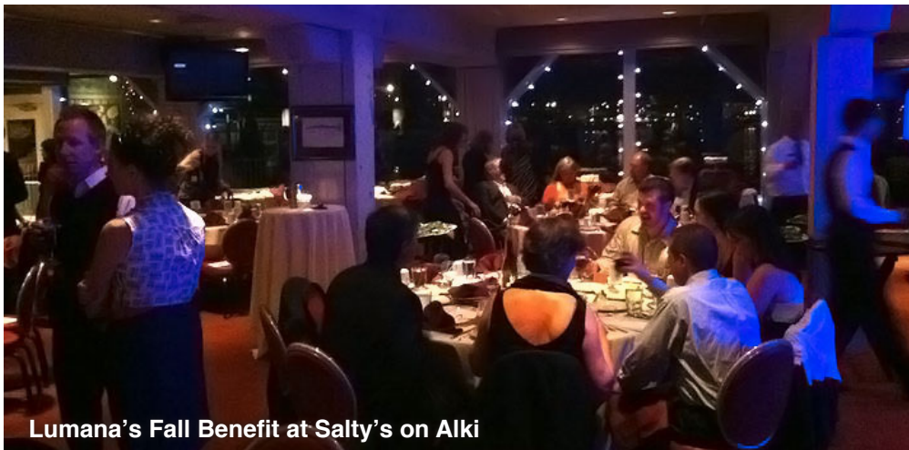
Lumana's Fall Benefit at Salty's on Alki

On October 14th Lumana hosted our 2nd Annual Fall Benefit Dinner and Auction at Salty's Restaurant on Alki. The night was a great accomplishment, as Lumana raised over 40,000 throughout the night! This new influx of funds will be used to support our plans to provide leadership training for high-performing microfinance clients; through leadership we believe our clients have the potential to create jobs for their peers and strengthen the economic base of the communities. Thank you to all of our donors for helping to fund this program!